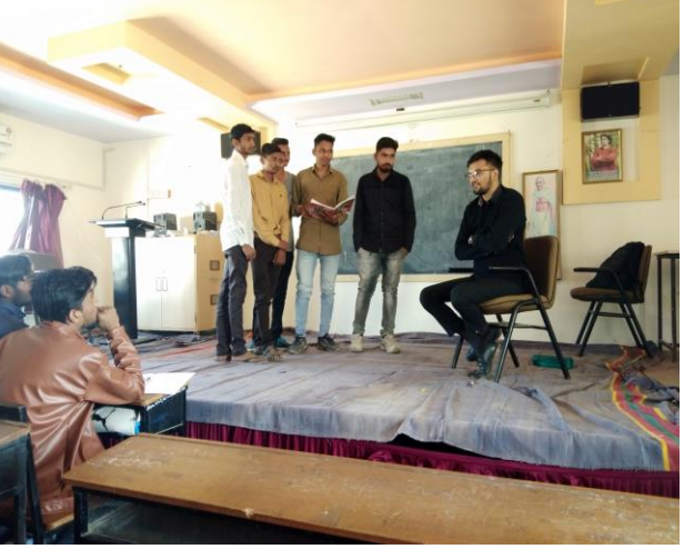
Review of Set Goals